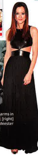
The girls bear arms in Sucker Punch ; [right] Leighton Meester